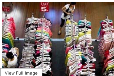
A shopkeeper counts merchandise in a downtown Beijing mall on Thursday. China's central bank has reaffirmed the benefits of a flexible currency.

A month after China announced it would ease its currency's de facto peg to the dollar, the yuan has gained just 0.7% against the dollar, and the stated policy shift has done little to defuse political anger at China in the U.S.