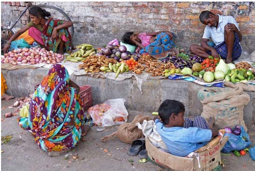
Roadside vegetable sellers wait for customers in Amritsar, India.

But does the same lightning really strike twice? Here's where the matter of head starts and late arrivals potentially becomes important. The seeds of China's growth spurt were planted in 1978, when Deng Xiaoping decollectivized agriculture and started welcoming foreign investment. For India, economic takeoff can be traced to 1991, when a foreign-exchange crisis forced Delhi to scrap controls on firms' production and imports in exchange for an international bailout.