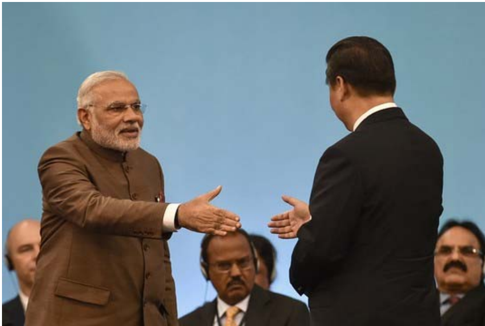
Indian Prime Minister Narendra Modi, left, shakes hands with Chinese President Xi Jinping during the 6th BRICS Summit in Brazil in July.

NEW DELHI—India today doesn't look quite like the economic dynamo that, just a few years ago, some predicted would overtake China as emerging-markets champion.