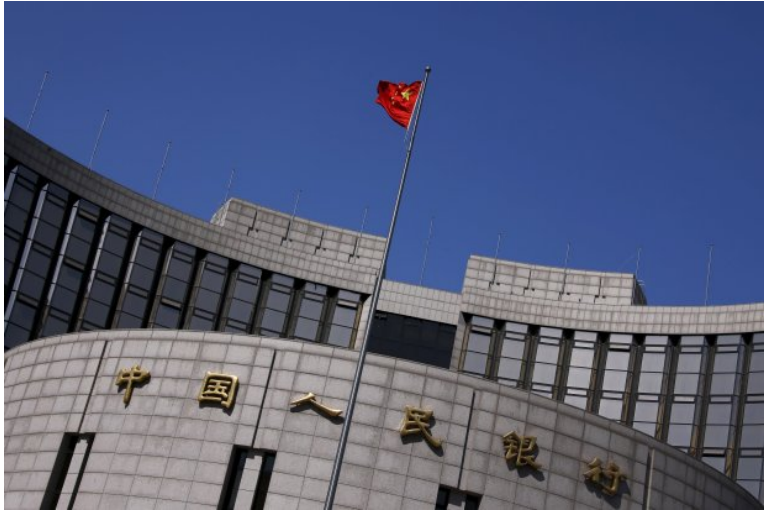
China's central bank on Friday also cut the reserve-requirement ratio for banks by 0.5 percentage point. Above, the People's Bank of China headquarters in Beijing.

Monetary Fund to include the Chinese yuan in its elite basket of reserve currencies when the IMF board votes on the issue next month.