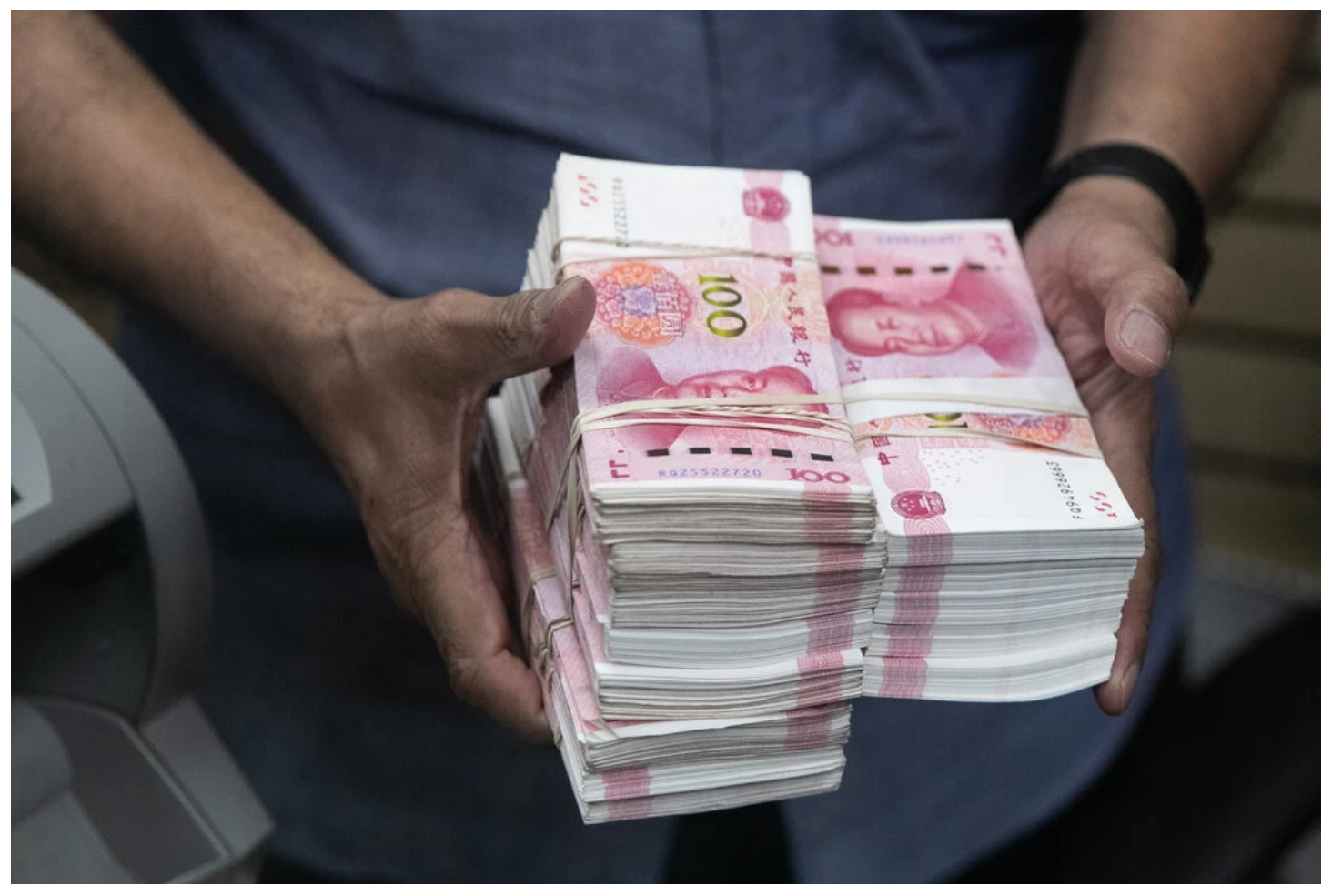
The renminbi has surged in strength in recent months against the American dollar and other major currencies.