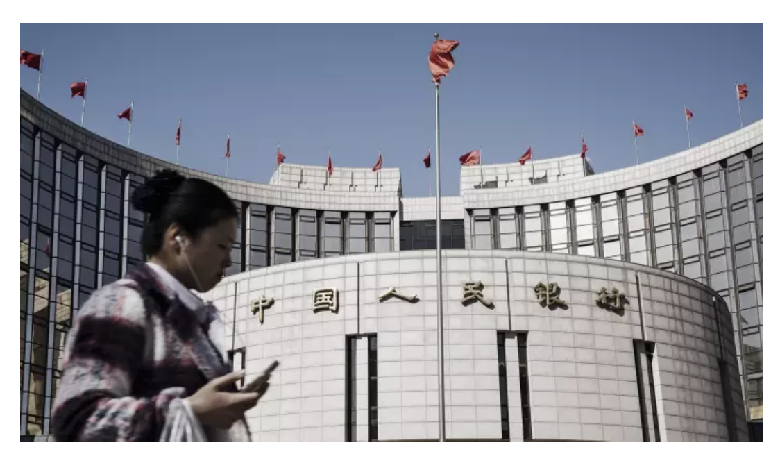
Beyond PBoC's liquidity management, higher rates are also due to a crackdown on wealth management products

So far, foreign investors in Chinese stocks and bonds have not faced restrictions. And for the moment, downward pressure on the renminbi has eased and foreign exchange reserves have stabilised, reducing the likelihood of further restrictions. But every dollar of foreign investment that flows into China's bond market today increases the regulators' incentive to keep that money from exiting tomorrow if outflow pressure resumes, as many analysts expect it will.