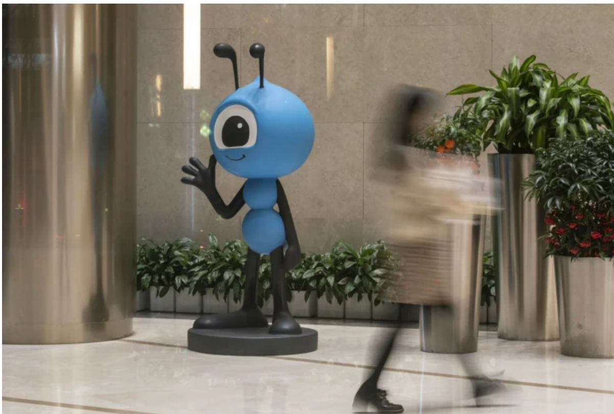
Ant Group headquarters in Hangzhou. Ant's $37bn initial public offering was scrapped just days after Liu's financial stability committee warned of 'the rapid development of financial technology and innovation'

On Monday, Xi chaired a high-profile meeting that increased the pressure on Ant and other internet platforms . According to state media, the party's central finance and economics committee warned that "some platform companies are developing in non-standard ways that present risks . . . It is necessary to accelerate the improvement of laws governing platform economies in order to fill in gaps and loopholes in a timely fashion."