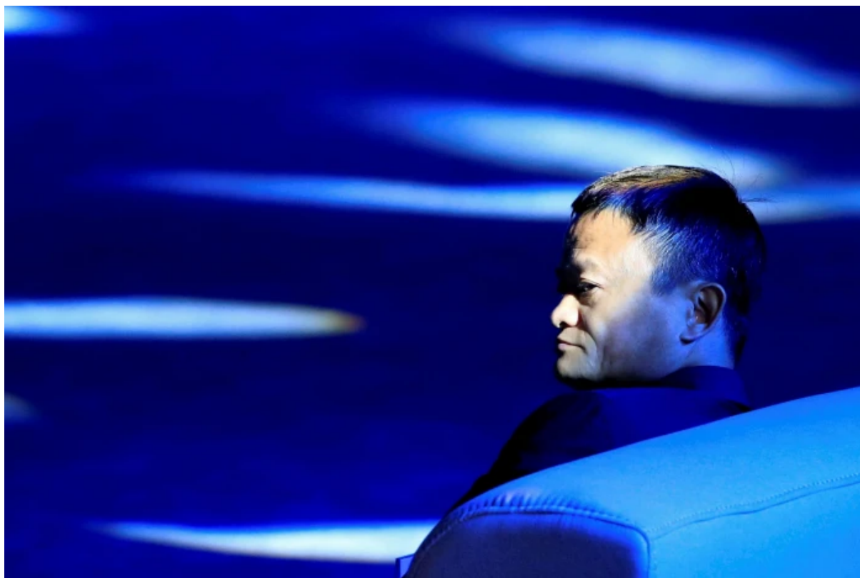
Jack Ma, head of Ant Group, made a speech criticising Xi and Liu's orthodox attitude to financial risk two weeks before Ant's IPO was abruptly cancelled by the authorities