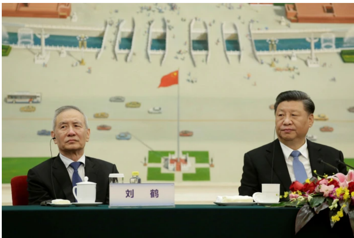
President Xi Jinping, right, and vice-premier Liu He. Some analysts warn that in curbing the credit-fuelled excesses of the past decade, Xi and Liu risk stifling innovative areas of financial activity and economic growth

Some analysts warn that in curbing the credit- fuelled excesses of the past decade, Xi and Liu risk an overcorrection that could stifle innovative areas of financial activity and, ultimately, economic growth. From 2016 to 2019, the average annual increase in China's corporate bankruptcies exceeded 30 per cent.