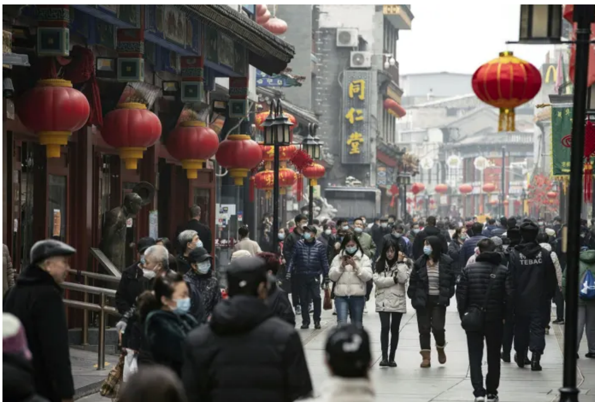
China's private sector accounts for 80 per cent of urban employment and 60 per cent of the country's economic output

“Security and development are now seen as inextricably linked and security trumps all other considerations,” Choyleva says. “Xi’s focus has been on identifying and pre-empting security challenges rather than [waiting to] deal with them once they arise.”