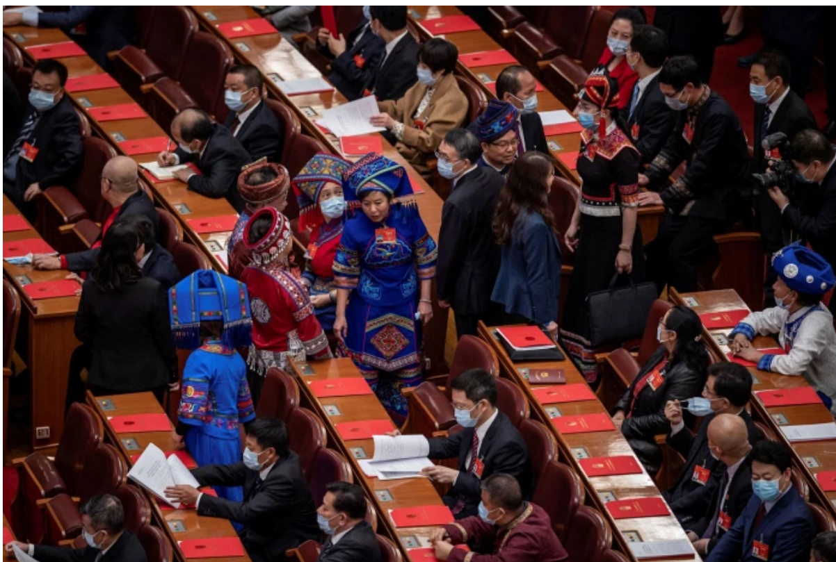
The annual session of the Chinese parliament at which the government announced it was to rein in most of the support measures that started last year in response to the pandemic