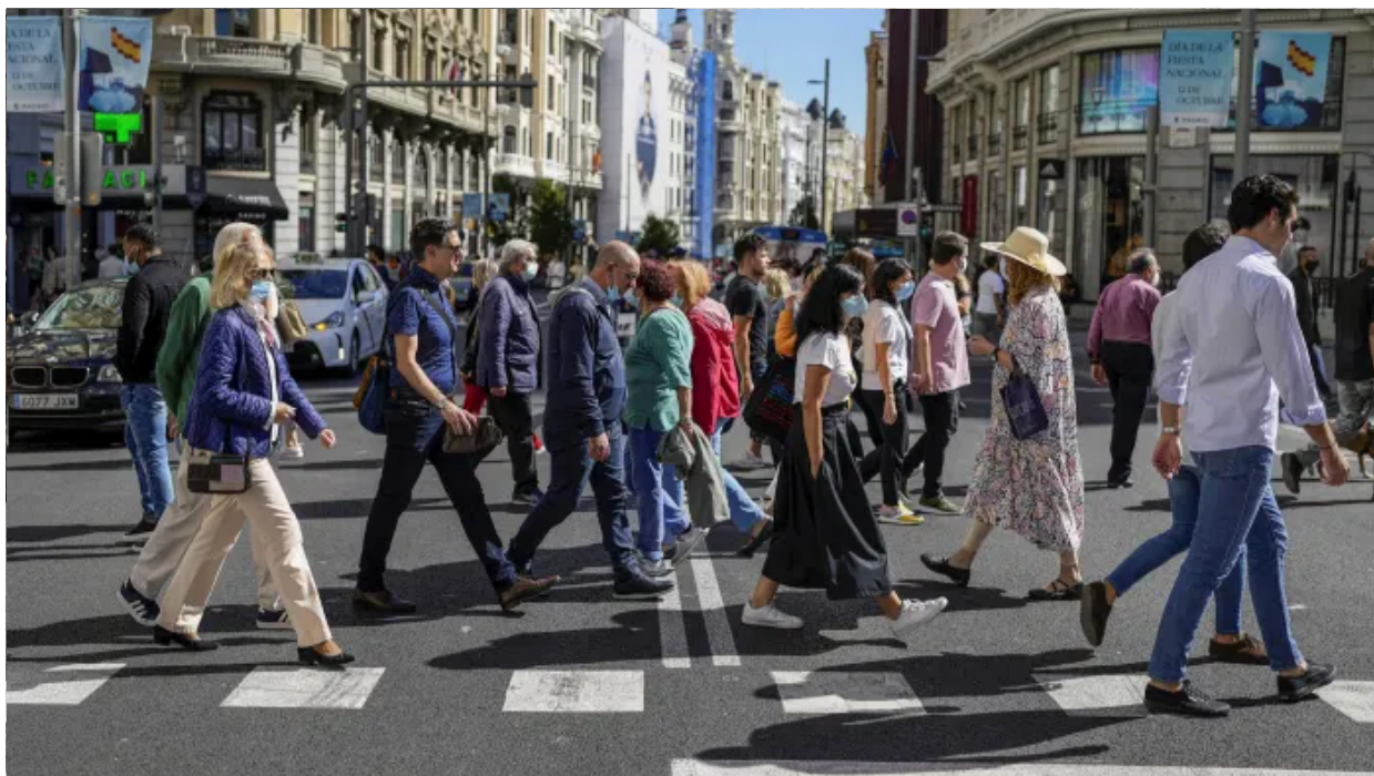
Strong growth over the summer appears to have slowed sharply in the eurozone