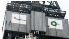
Transocean Steps Up Legal Battle