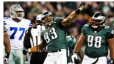
A Defense That's Dressed to the Nines