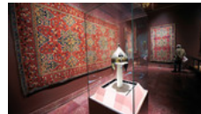
Met's New Islamic Galleries Open