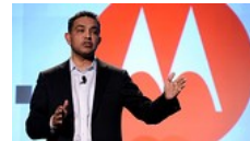
Mergers Open 'Golden Parachutes'