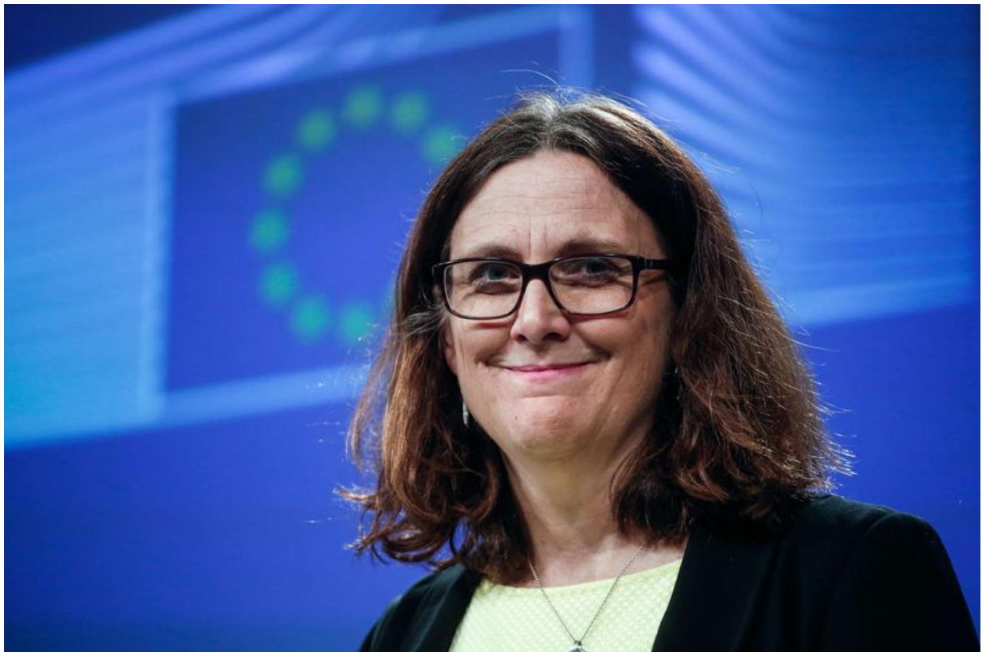
Cecilia Malmstrom