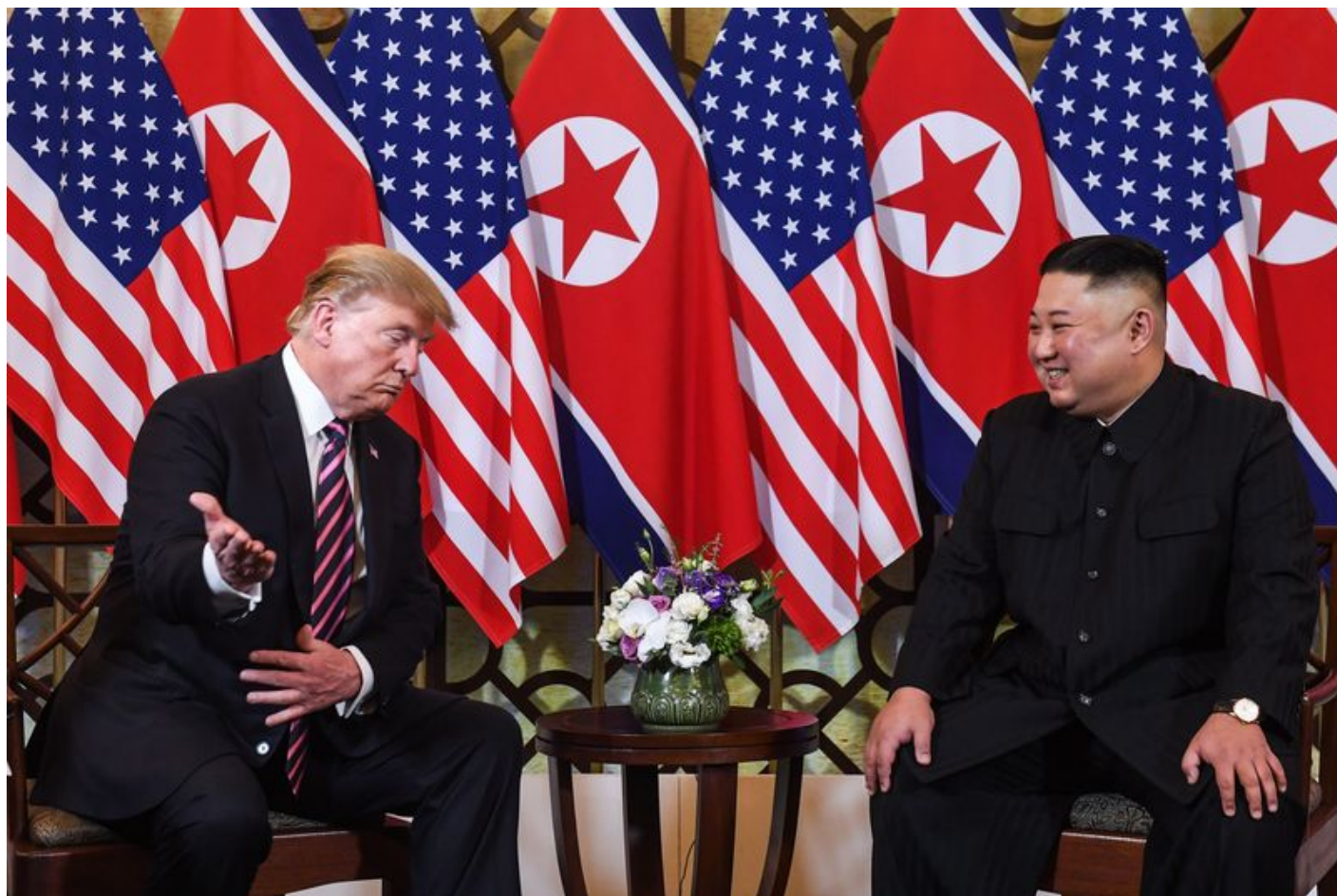
Donald Trump with Kim Jong Un in Hanoi on Feb. 27.

Last month, Trump's decision to walk away from his Hanoi summit with North Korea's Kim Jong Un without a deal only reinforced China's concerns about the president's unpredictability.