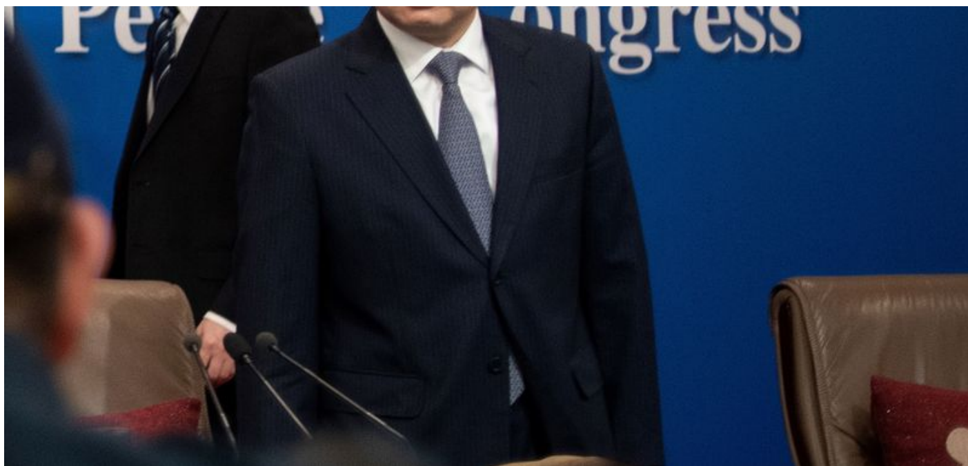
Wang Shouwen